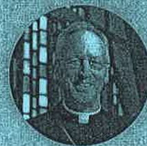
Celebrating Mass with