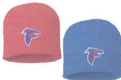
Item 2 Royal Skull Hat—Red or Royal $13