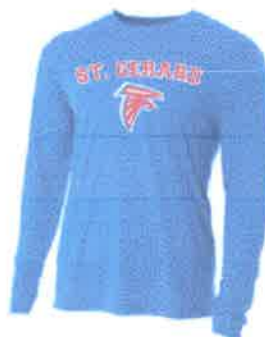
Item 4 Royal Long Sleeve Performance Crew T-Shirt - Logo 1