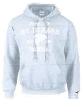
Item 5 Sport Grey or Pink Sweatshirt - Logo 2