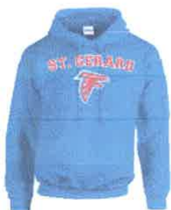
Item 3 Royal Sweatshirt - Logo 1