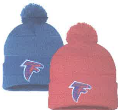
Item 1 Pom Pom Hat Red or Royal $15