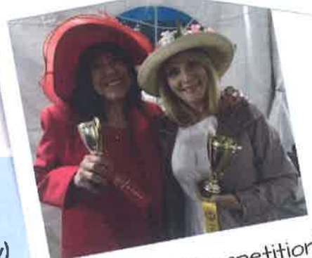
Derby Hat Competition!